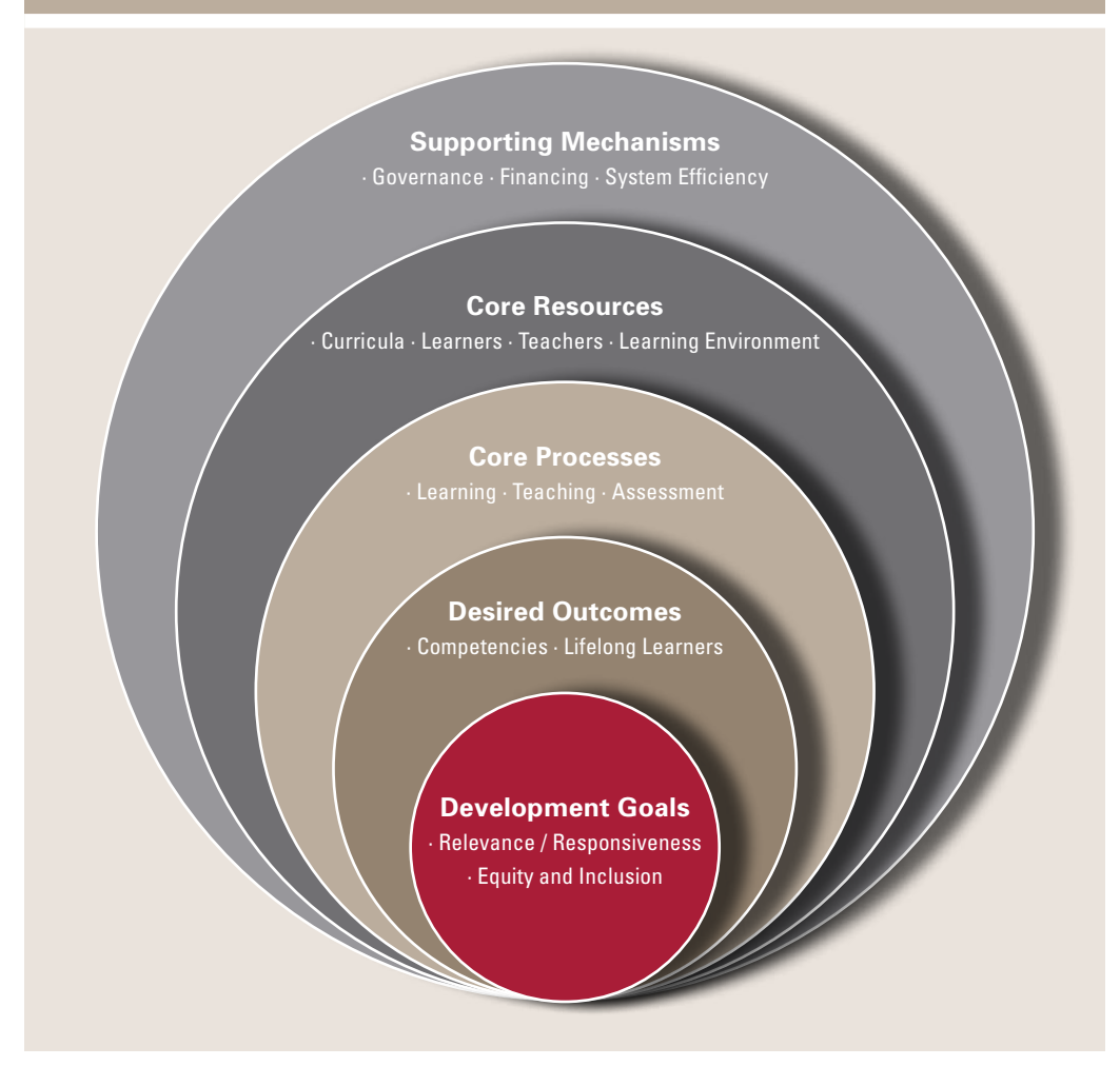
Figure 6.1 UNESCO General Education System Quality Analysis/Diagnosis Framework (GEQAF)