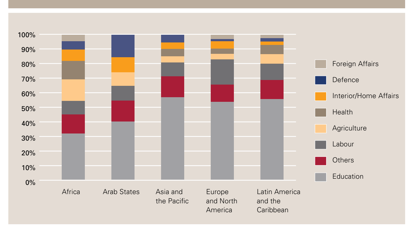
Figure 1 Governmental organisations involved in the reporting process, by region

Figure 1 shows that education ministries were the main institutions reporting on national progress in adult learning and