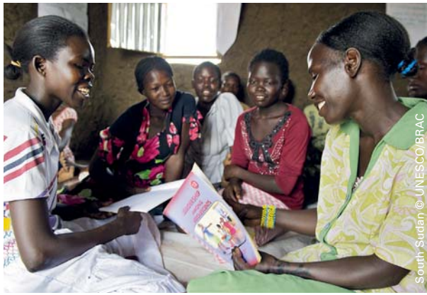
Adolescent Girls' Club in South Sudan

community. Local people – leaders, school teachers and affected citizens – play active roles in the day-to-day management and organisation of the centres. Many of them work on a voluntary basis to serve the community, which may range in size from a village to a district. Staff are recruited locally so they know the people, their language, culture and living circumstances. The centres are located in key community venues, such as primary schools, village administration offices, places of worship, or in their own dedicated premises. Successful community learning centres are embedded in the community they serve.