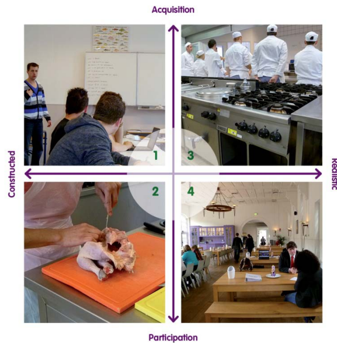
Figure 5: Four quadrants of hospitality case

In Figure 5, four situations of the learning environment of the hospitality case are shown. There is a classic frontal lecture situation (constructed-acquisition, Quadrant 1), though it should be noted that the lecturer in question enacts multiple roles as he is also a senior professional and role model in the kitchen as chef with numerous years of experience in Michelin-starred restaurants. To practice specific skills, such as knife skills, there is a training kitchen for simulations and authentic assignments (constructed-participation, Quadrant 2).