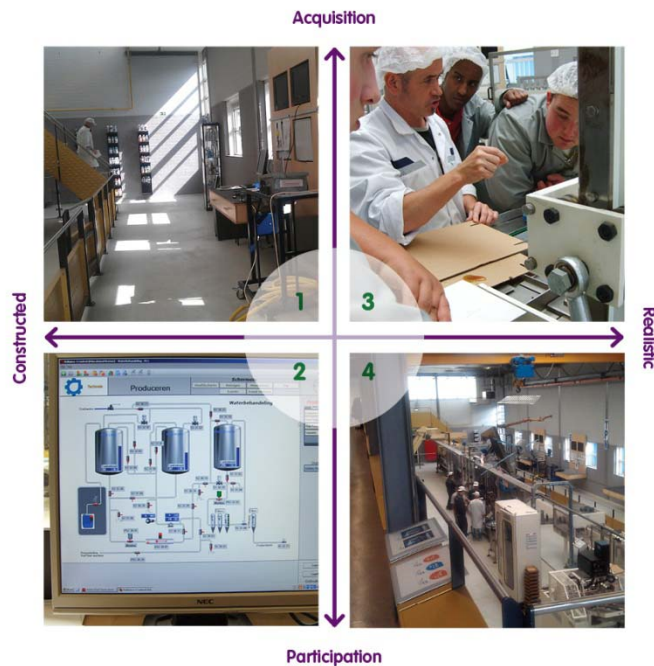
Figure 4: Four quadrants of technology case

In the previous section, the four perspectives were used to unravel the hybrid learning environments of the three cases and identify “quick wins”. In this section, the two dimensions and four quadrants are applied to each case.