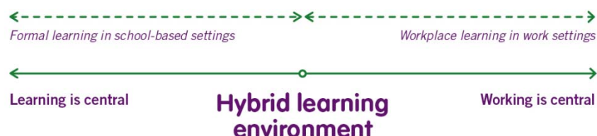
Figure 1: Integrate and merge: interweave learning and working processes

In this paper, we take it one step further. Instead of merely combining, connecting or joining aspects of learning in school and experiences in work settings or the other way around by expanding workplaces with learning features, we are interested in how they might be integrated and merged .