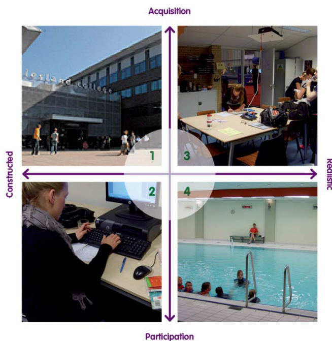
Figure 6: Four quadrants of the sports case

In Figure 6, four situations of the sports case are shown. The constructed-acquisition (Quadrant 1) is mostly situated in the school itself, which is next door to the sports and leisure centre where most of this learning environment is situated. To enrich the daily work, learners have to carry out more complex assignments in the context of their work such as planning a special event or making the monthly duty-roster, (constructed-participation, Quadrant 2).