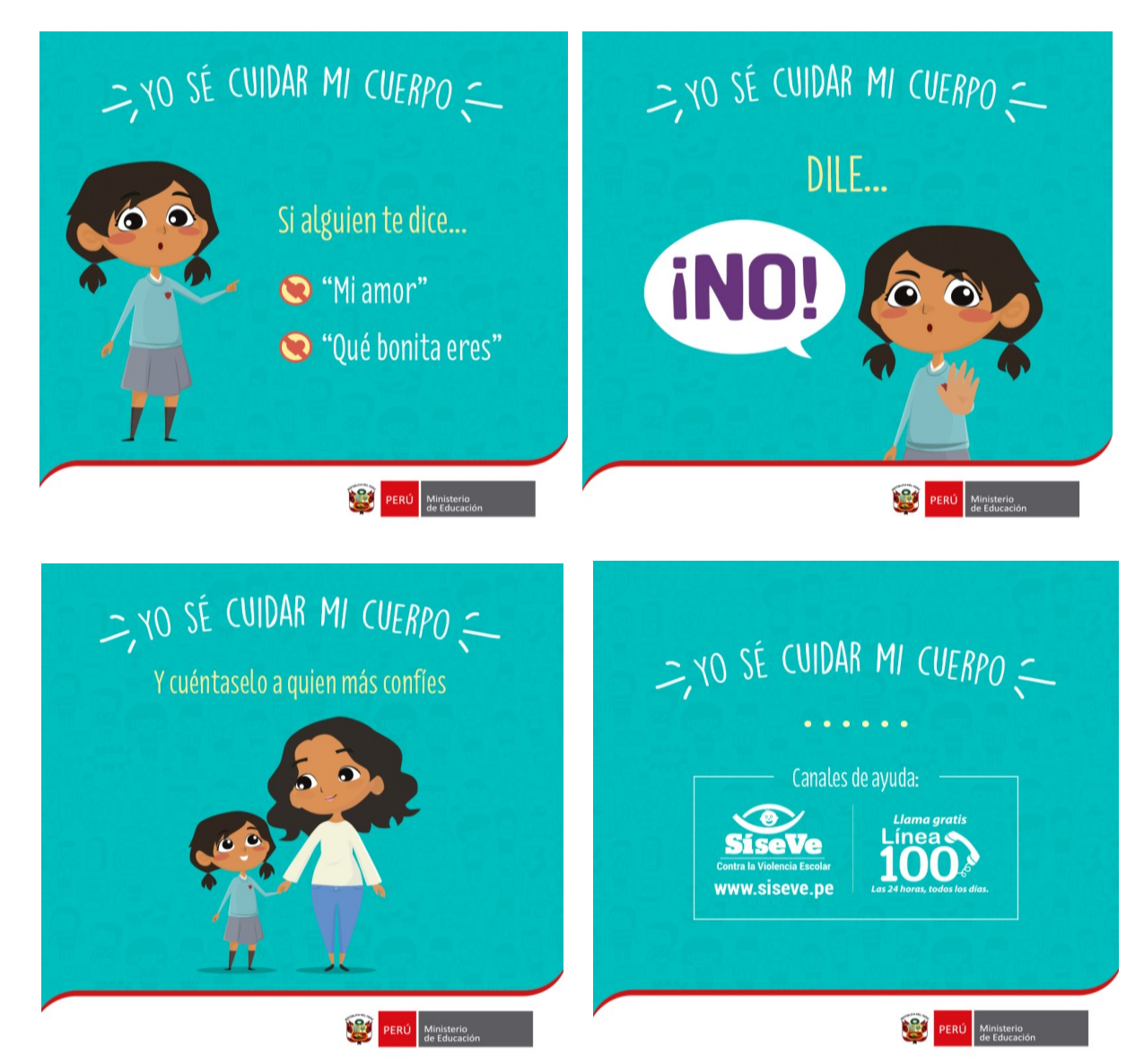
Part of Minedu's Yo se cuidar mi cuerpo campaign: "If someone tells you, 'My love' or 'How beautiful you are', Tell them no! And tell someone you trust. I know how to take care of my body."

A few respondents also noted that Minedu re-introduced a campaign 'Yo se cuidar mi cuerpo (I know how to take care of my body)' 19 to prevent and respond to sexual abuse. According to a Minedu press release, 20 the campaign was launched in collaboration with MIMP and the Ministry of the Interior in November 2016 at a school in San Isidro. The campaign includes a song, which was originally introduced in schools several years ago but has been updated and is now available on the campaign website in Spanish and Quechua via videos and ringtones. The campaign also includes separate guidelines for parents and teachers on how to prevent and response to sexual abuse, and information to teach children how to recognise inappropriate touch or behaviour, including a 'Bingo' board game.