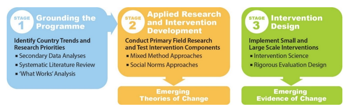
Figure 1: Stages of the Multi-Country Study

"The study consists of three inter-related stages: 1) Grounding the Programme, 2) Applied Research and Intervention Development, and 3) Intervention Science and Evaluations. Each stage has a distinct set of objectives, activities and milestones that feed into the main outcomes and outputs of the study, and inform both ongoing country programming and the emerging global evidence base on violence prevention." (See Figure 1; For more details about the study process, see: Maternowska, 2014).