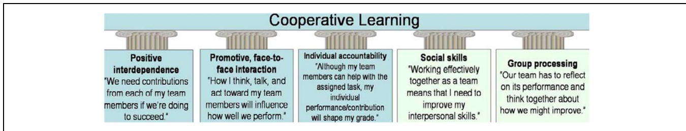
Figure 1. Cooperative learning.