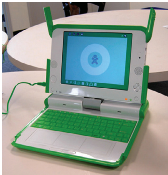
XO computers used in Kenya to empower self-help groups through ICT for alternative livelihood activities

In contrast to projects such as these, which were all implemented within local communities, the NaDEET (Namib Desert Environmental Education Trust) Environmental Literacy Project set up an environmental education centre on the NamibRand Nature Reserve in Namibia's southern Hardap Region. Run by a group of environmental activists, the centre works with both children and adults to provide hands-on experiential learning and the opportunity to reflect on their real-life experiences in relation to sustainable living and climate change. The centre also produces publications, including the Bush Telegraph , a youth magazine covering environmental topics with a distribution of more than 18,000 (over half of the readership of the Namibian national newspaper). Their sustainability booklet series is also available to download in PDF versions. Like the Mayog programme in Malaysia, this project aims to engage a broad range of people – not only non-literate women. Through the booklets, participants can share what they have