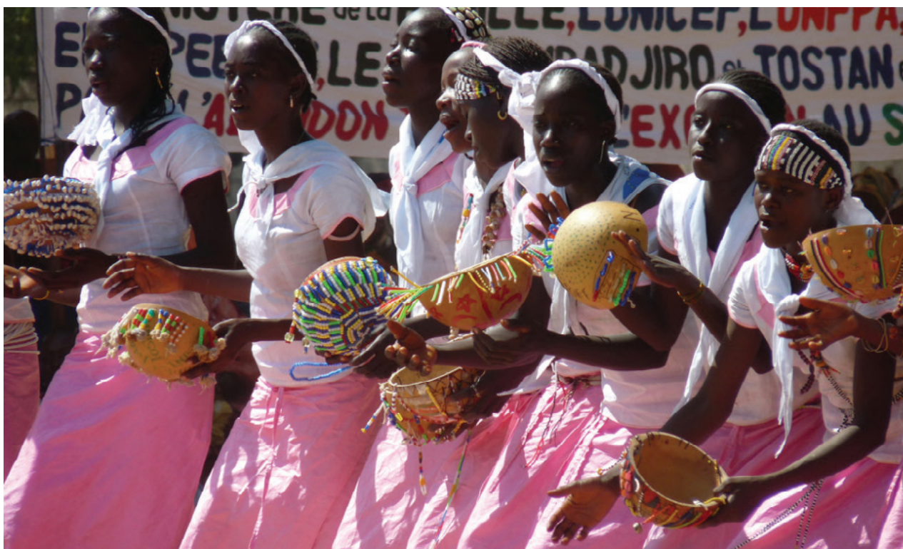
Tostan's Community Empowerment Programme draws on traditional African song and dance

civic education activities outside the classroom, such as theatre groups. This example shows that the women participants and the facilitators had contrasting ideas of what empowering education should consist of.