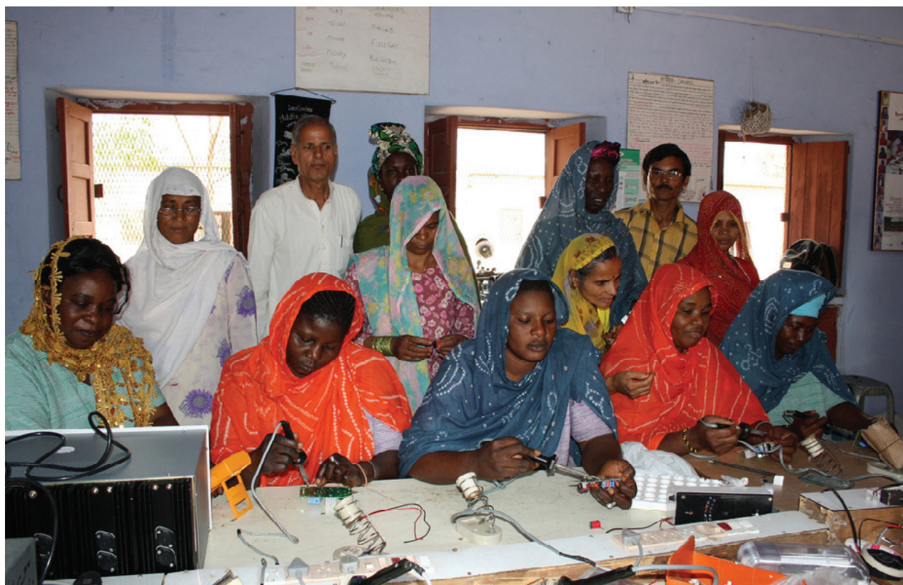
Women participating in the Senegalese Tostan Community Empowerment Programme

mental sustainability remained largely undisputed, 25 years on, sustainable development policies had still not been put into practice due to a lack of political will (UN 2012a, p. 4). Their report ( Resilient People Resilient Planet: A future worth choosing ) also pointed to the need to develop a 'common language for sustainable development' so that social activists, economists and environmental scientists could begin to work with each other to bring these ideas into mainstream economics (ibid, p. 5). The panel emphasised economic growth as the main imperative for sustainable development and women's empowerment - above the other two 'pillars' (social equality and environmental sustainability) - noting the costs of excluding women from the economy and the need for training to prioritise women so that skill shortages could be met. They suggested that 'the next increment of global growth could well come from the economic empowerment of women' (ibid, p. 6). The report argued that gender equality was an essential dimension of sustainable development, requiring support for women as leaders in the public and private sectors. The panel discussed the role of formal educational and training institutions in capacity building, and noted the potential of 'non-conventional networks and youth communities' (ibid, p. 16), such as inter-