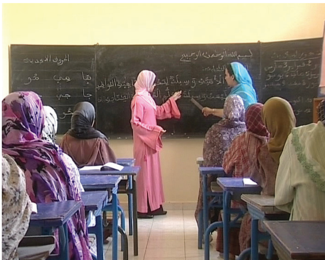
Women of the Argan Cooperative learning about current threats of economic exploitation to the environment

grammes set out to combine at least two of these dimensions - an important part of this analysis is to identify how programmes have developed the synergy between the three dimensions. However, in order to look in more depth at the relationship between literacy and each pillar, programmes have been categorised initially according to which sustainable development dimension is their main focus or entry point.