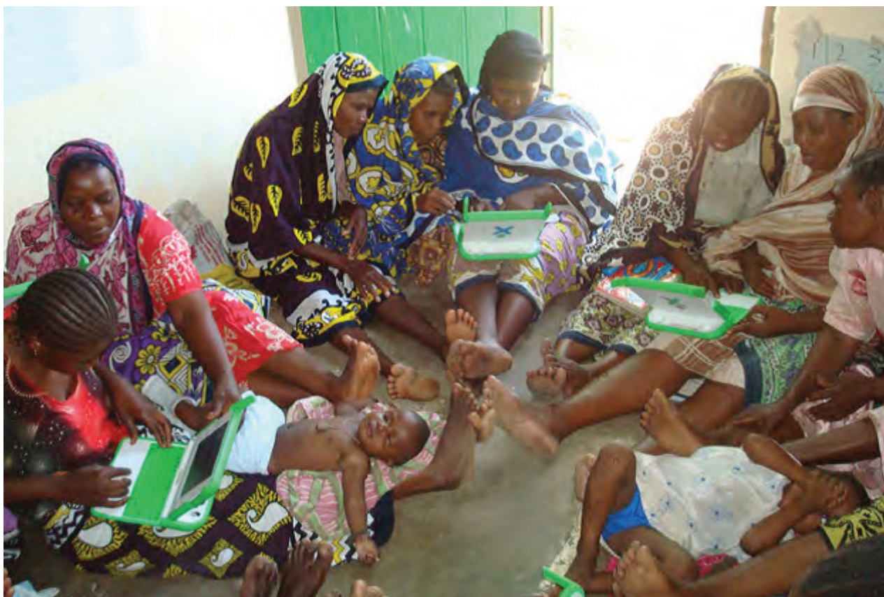
Women learning about preserving marine environments in Kenya using XO computers

is now widespread recognition that ‘empowerment means different things for women in different situations’ (UIL 2014, p. 3) and that education alone is rarely sufficient to generate such social and political change. However, the tendency to think of ‘women’s empowerment’ as an output rather than a process still persists and this is reflected in the kind of research evidence used to analyse women’s empowerment. Statistical measures of women’s literacy, decision-making and economic participation have a greater influence on policy than ethnographic insights into how women’s lives and identities are changing. As Sholkamy (in DFID 2012, p. 9) has suggested, we need to move beyond a mechanistic notion of women’s empowerment to a deeper understanding of both policy and practice: ‘Women’s empowerment is often treated by international agencies as something that can be designed as a policy blueprint, rolled out and scaled up. What actually happens when policy is conceived, negotiated and shaped may be altogether different’. This relates also to our earlier discussion on the practical difficulties of implementing critical literacy pedagogies on a large scale and the unanticipated ways in which participants and staff may shape a programme at local level.