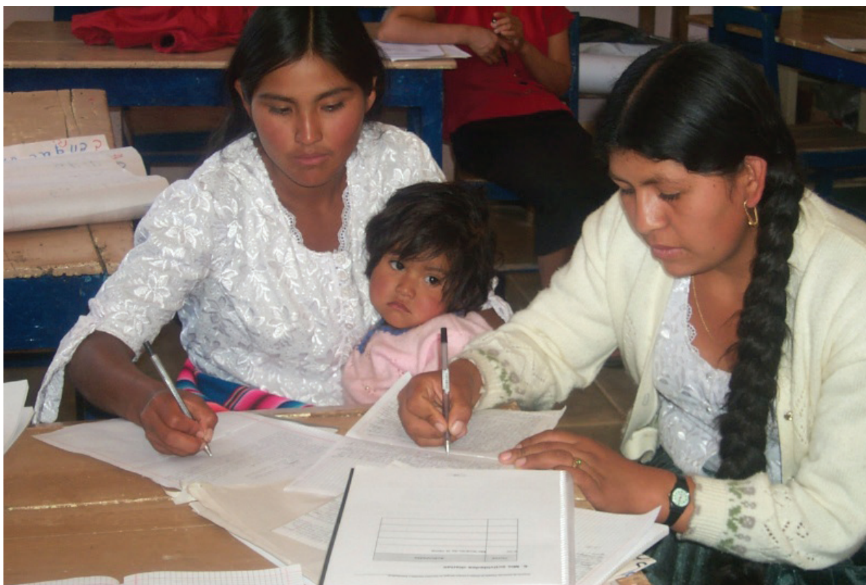
The Ministry of Education, Culture and Sport's ' Bilingual literacy project in reproductive health ' in Bolivia