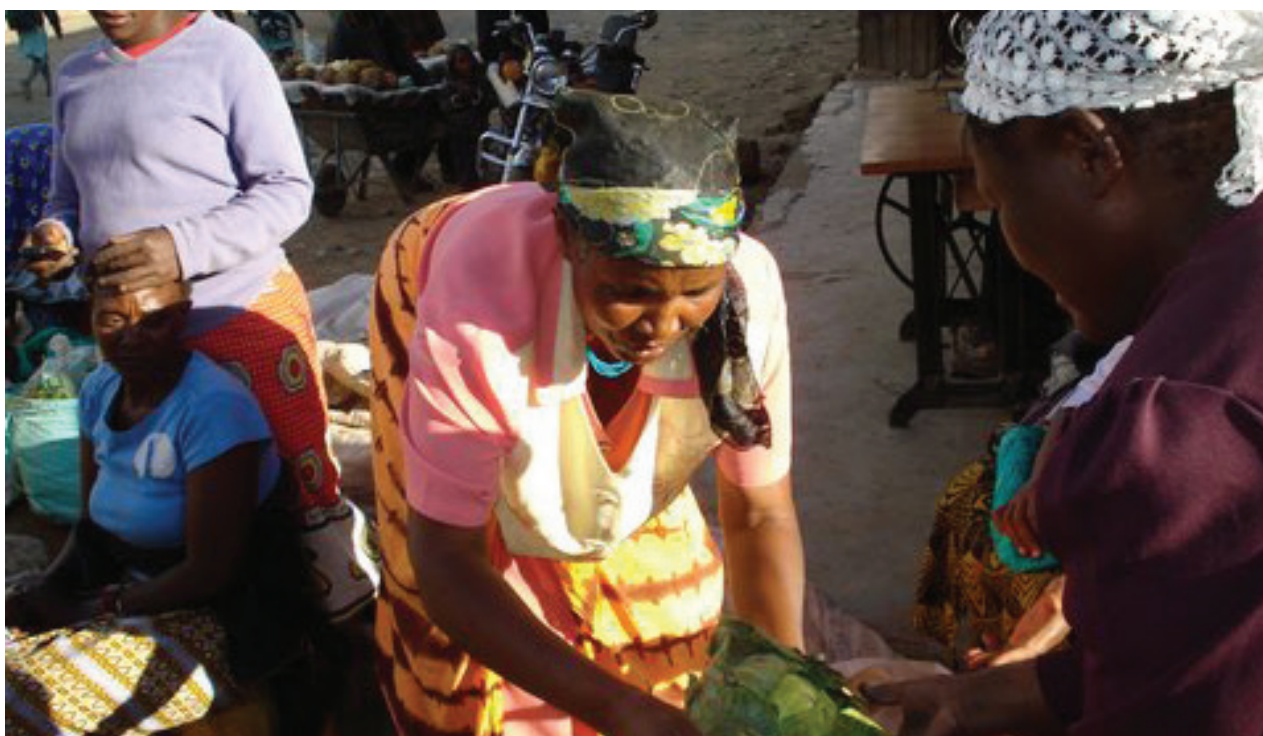
Farmers selling goods on a local market