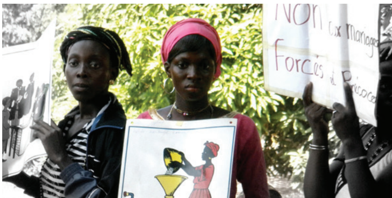
Community mobilisation to address harmful social practices such as female genital cutting (FGC) by Tostan in Senegal

This review of how literacy programmes have begun to facilitate social change indicates the value of adopting a bottom-up approach based on a recognition of women's existing roles, values and practices. Whereas in one cultural context, the key to empowering women may lie in strengthening indigenous practices, languages and knowledge