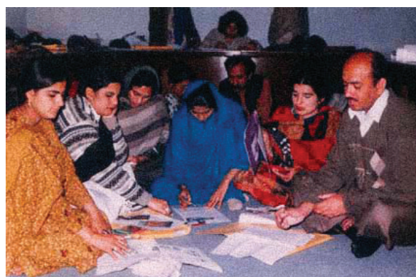
BUNYAD's Adult Health Functional Literacy Programme in Pakistan

duced vocational training in organic farming and livestock training for young women, which were traditionally male areas of study (Eldred 2013: 24). Through women gaining qualifications and employment in these new areas of work, there was the potential to change attitudes more widely around gender roles. Other literacy programmes have also recognised the importance of providing women with the opportunity to gain not only basic literacy skills, but also a qualification that can lead to formal employment. The NGO Association Algerienne Alphabetisation's (IQRAA) Literacy Training and Integration of Women programme in Algeria supports women to empower themselves through gaining a qualification and has negotiated with the Ministry of Vocational Training for their literacy certificate to be recognised. In Brazil, the Ministry of Education's National Programme of Adult and Youth Education integrated with Vocational and Social Qualification took an alternative approach. It worked within the formal education system to challenge the historical dichotomy between basic education and vocational training and to refocus on family agriculture through using a Freirean approach and the notion of work as social practice.