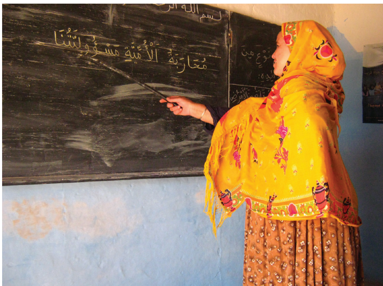
Participant of the Moroccan Functional Literacy Programme of Women of the Argan Cooperative

teamwork, creative skills and interpersonal behaviour. The concept of 'green skills' has also been discussed in relation to soft skills. These can include leadership skills, adaptability to apply new technologies, environmental awareness (ibid, p. 30) and attitude change around the three Rs (reduce, reuse and recycle) (UN, 2012b, p. 26). Young people in particular require such capacities to respond to the rapidly changing and increasingly risky rural agricultural environment, with ever shrinking access to land and resources (IFAD-UNESCO, 2014). However, soft skills alone are not sufficient. UNESCO-INRULED (2012, p. 22) calls for a 'multi-pronged approach' linking literacy skills, production skills (including some specialised green skills for new occupational categories), quality of life components and other support (such as access to credit or legal reforms around land ownership). This more holistic approach to skill development proposes the concept of a learning community, recognising that skill training occurs in 'formal, non-formal and on-the-job settings' (ibid, p. 10).