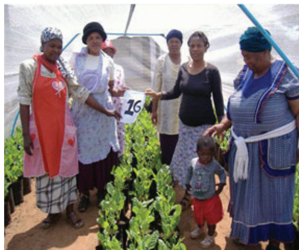
The Operation Upgrade 'Literacy Garden' in South Africa

By contrast, the Adult Literacy and Skills Training Programme in South Africa focuses on agriculture and adopts a 'literacy second' approach. The NGO Operation Upgrade, which primarily targets women aged between 25 and 50 years, provides a vege-