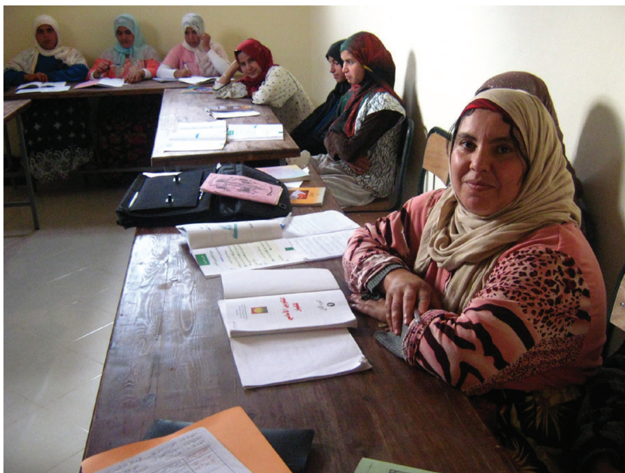
Functional Literacy Programme of Women of the Argan Cooperativ, Morocco

existing knowledge and helped develop their roles and capacities through writing, editing and publishing books for the children in their community.